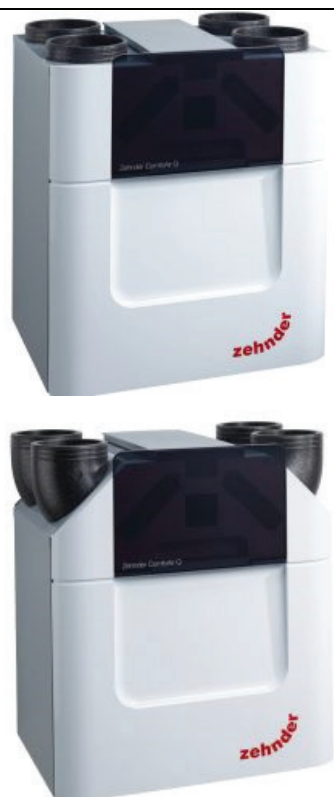
ComfoAir Q Series

Return side: G4 = MERV 7/8 Black Supply side: F7 = MERV 13 Red