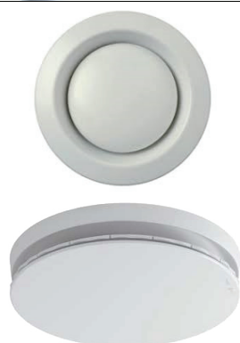
STB & Luna Return Diffuser

Return side: G4 = MERV 7/8 Black Letters Supply side: F7 = MERV 13 Red Letters